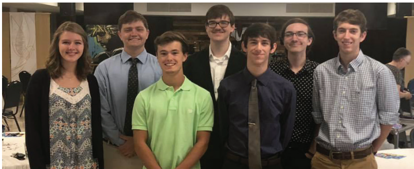
On Sunday, June 2, we celebrated our graduating high school seniors during the 10:30 worship service and recognized our scholarship recipients.